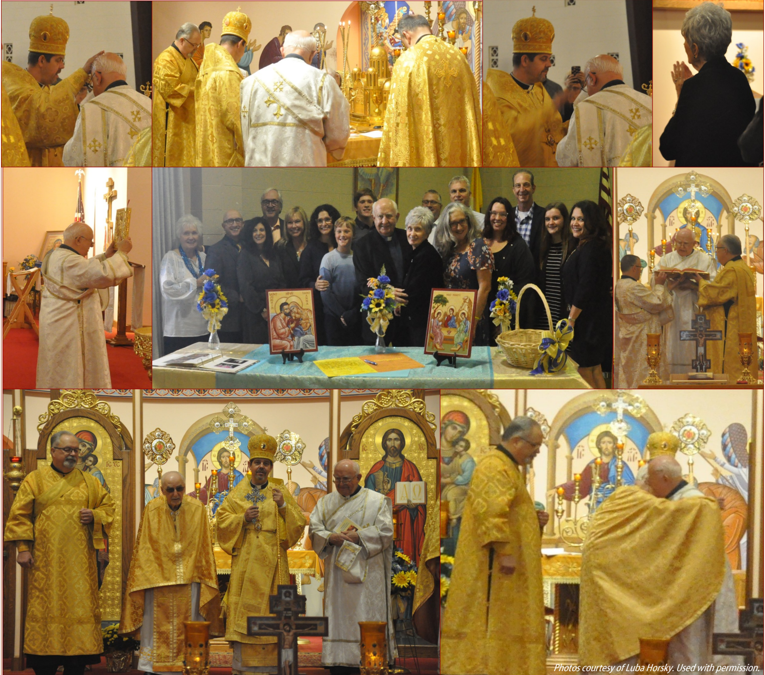
Used with permission.